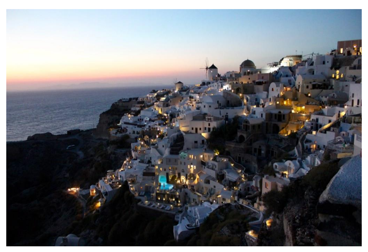
Other well-known Cycladic islands: Naxos - Paros - Antiparos - Ios - Folegandros - Sifnos - Milos